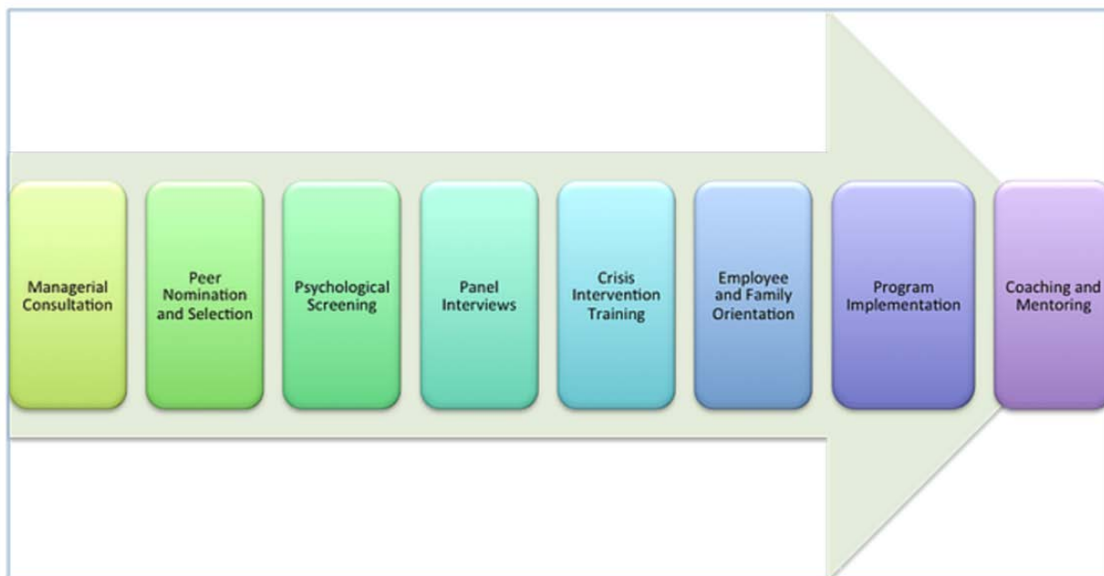
Figure 4.4: First Responder Trauma Prevention and Peer Support Training Program (TEMA)

Some organizations also invite staff members to nominate themselves. The following is an example of a process organizations might use in this case [see the ForYOU Activation policy ].